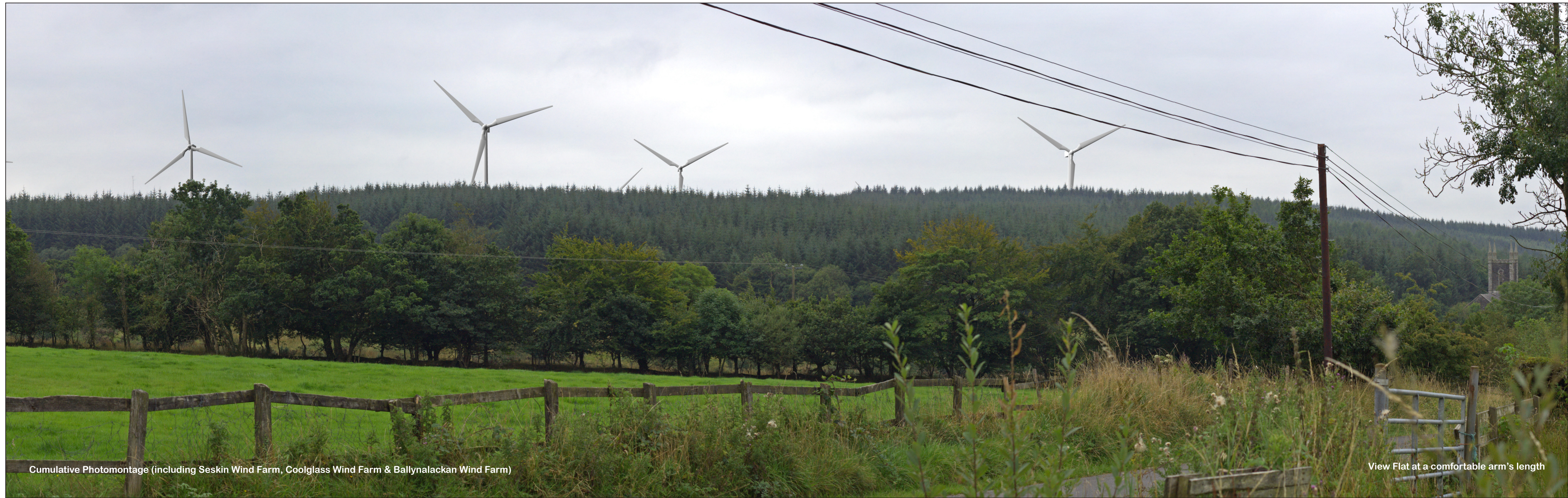
Cumulative Photomontage (including Seskin Wind Farm, Coolglass Wind Farm & Ballynalackan Wind Farm)

OS Reference: 664987E, 672593N (ITM) Horizontal field of View: 53.5° (Planar Projection) Camera: Nikon EOS 6D Eye Level: 261m AOD Principal distance: 812.5mm Lens: 50mm (Nikon f/1.8) Direction of View: 204 degrees Correct Printed Image Size: 820 x 260mm Camera height: 1.5m AGL Nearest Turbine: 6,338m to Turbine T7 Date & Time: 02/09/2021 11:33