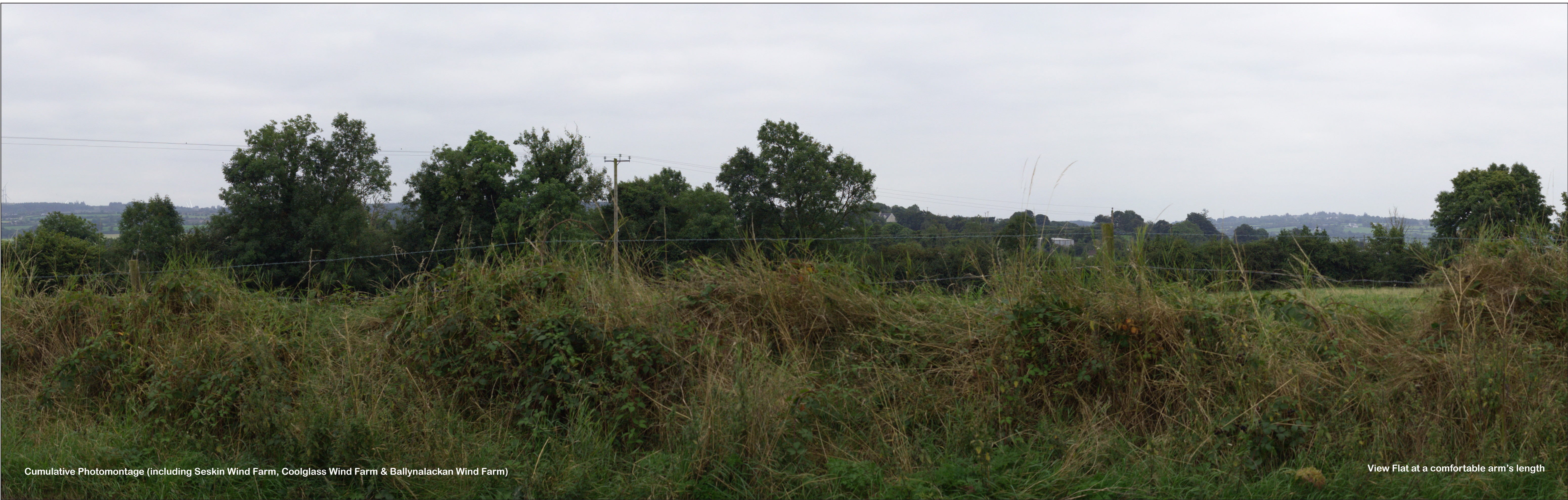
Cumulative Photomontage (including Seskin Wind Farm, Coolglass Wind Farm & Ballynalackan Wind Farm)

OS Reference: 659827E, 679591N (ITM) Horizontal field of View: 53.5° (Planar Projection) Camera: Nikon EOS 6D Eye Level: 203m AOD Principal distance: 812.5mm Lens: 50mm (Nikon f/1.8) Direction of View: 177 degrees Correct Printed Image Size: 820 x 260mm Camera height: 1.5m AGL Nearest Turbine: 12,053m to Turbine T7 Date & Time: 02/09/2021 16:34