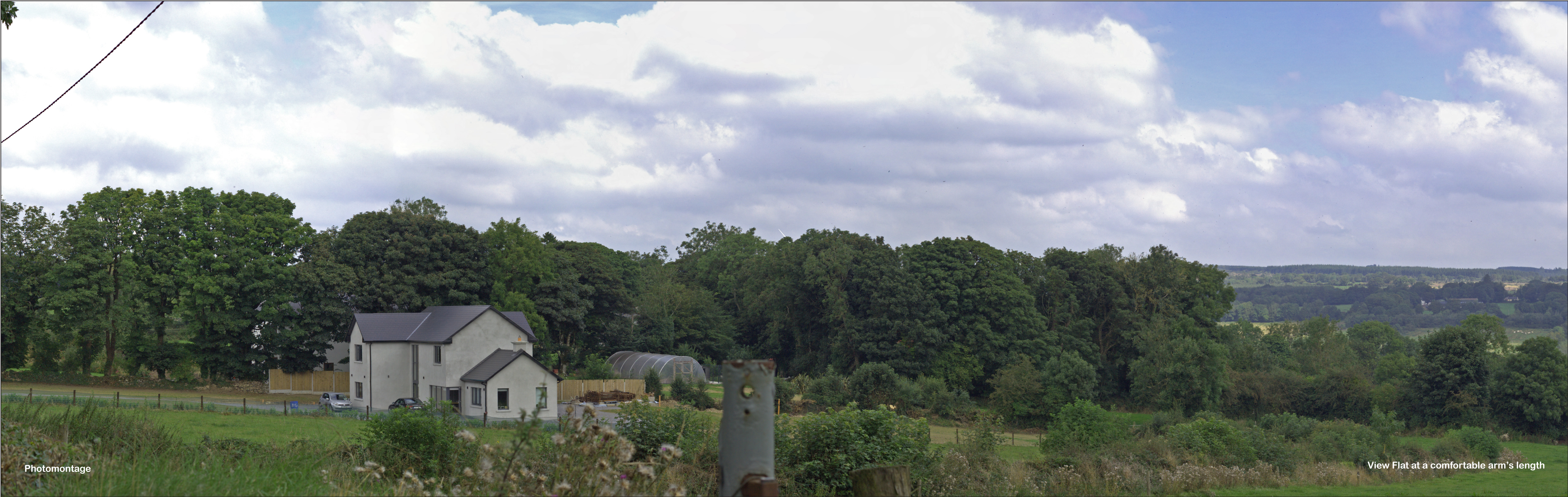
Figure 126: Viewpoint 22 - Photomontage