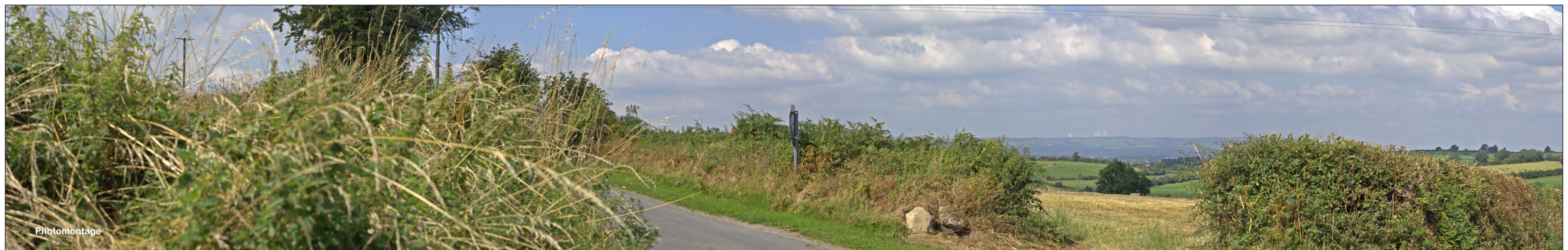
Figure 131: Viewpoint 24 - Baseline Photograph & Wireline

OS Reference: 672303E, 656386N (ITM) Horizontal field of View: 90° (Cylindrical Projection) Camera: Nikon EOS 6D Eye Level: 139m AOD Principal distance: 812.5mm Lens: 50mm (Nikon f/1.8) Direction of View: 315 degrees Correct Printed Image Size: 820 x 260mm Camera height: 1.5m AGL Nearest Turbine: 14.483m to Turbine T4 Date & Time: 25/08/2021 14:01